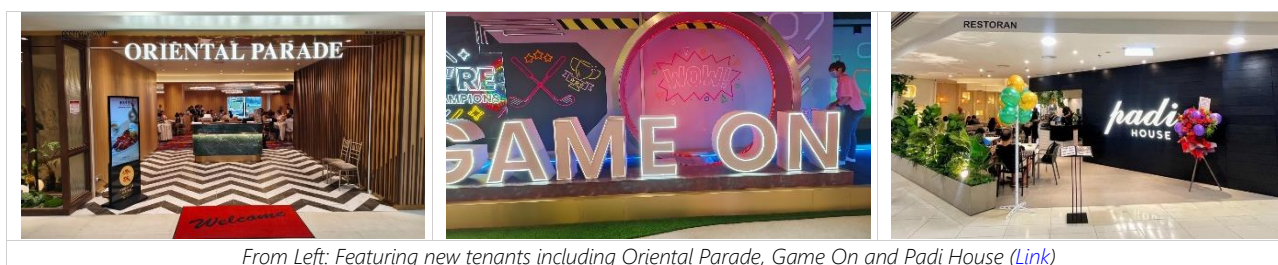
From Left: Featuring new tenants including Oriental Parade, Game On and Padi House ( Link )

On the performance of Hektar REIT's retail assets in Q3 2024, Hektar REIT's portfolio occupancy rose to 88.8% while its rental reversion rate continues to be on upward trajectory at 7.2% compared to previous year. Significant improvements can be seen in Subang Parade, which has been the Manager's major focus for value enhancement. With strategic leasing approach, the REIT managed to signed up new and prominent tenants that are aligned with Subang Parade's overall repositioning. Several new names have already opened their doors to customers including Oriental Parade, Padi House, Game On entertainment hub, Camille and Swet Fitness Centre, with a few others including Mokky's Pizza and The Farm & Chan Rak BBQ on track for opening by end-2024.